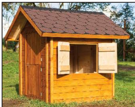
Build a Playhouse! For Dads and Teens — work together under the supervision of master builders and build a REAL HOUSE! All who work on the project will be entered in a drawing to WIN the house when it's completed! Achieve something together you never thought you could!