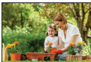
Moms & Daughters Plant a Garden Together!