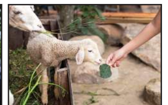
Petting Zoo All kinds of fun baby animals to interact with and learn about!