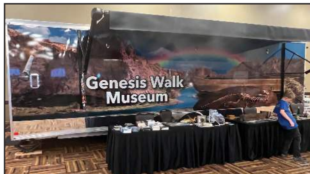
Mobile Creation Museum! Dinosaurs, Fossils, and much more! Come explore and learn about how the world was created and take home some neat souvenirs!