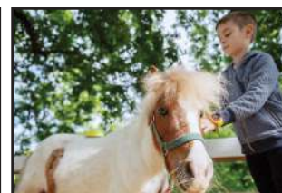
Pony & Cart Rides Just like 'down on the farm!'