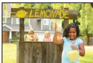
Kids (age 5-13) Work at our Lemonade Stand & keep the money you earn!