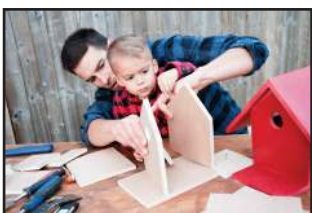
Fathers & Sons Build a Birdhouse Together!